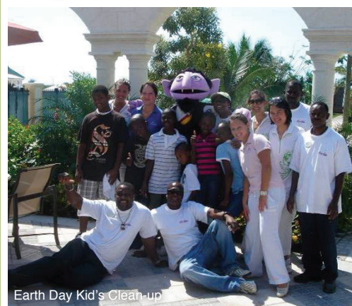
Earth Day Kid's Clean-up