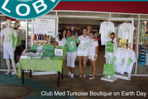
Club Med Turkoise Boutique on Earth Day