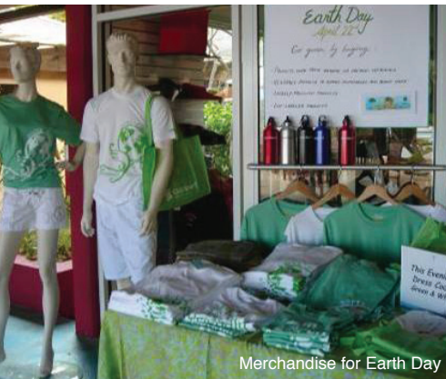
Merchandise for Earth Day