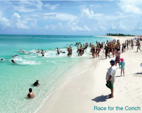
Race for the Conch