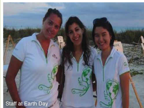
Staff at Earth Day