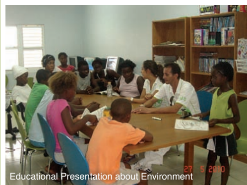
Educational Presentation about Environment