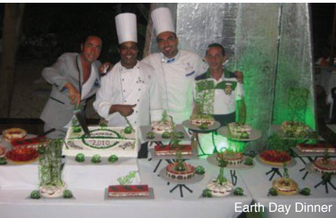
Earth Day Dinner