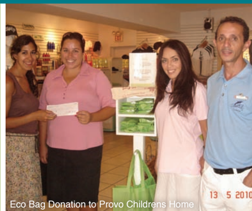
Eco Bag Donation to Provo Childrens Home

Also, landscaping waste is being used for producing compost in partnership with their landscaping services provider. There is a project to start composting with organic food waste from the kitchens on-site.